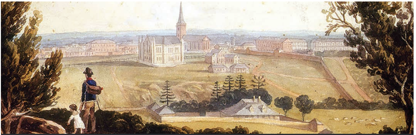
Hyde Park Barracks and the first St Mary's Catholic Church 1835.