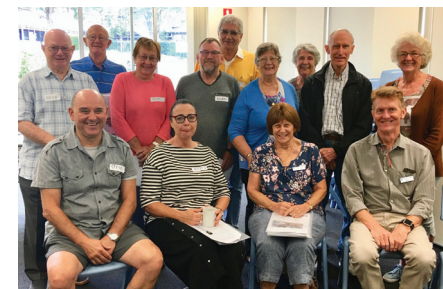
Menai St Vincent de Paul Conference – Faith Sharers!

(A closed group means that only people who are genuinely interested in our aims can join.)