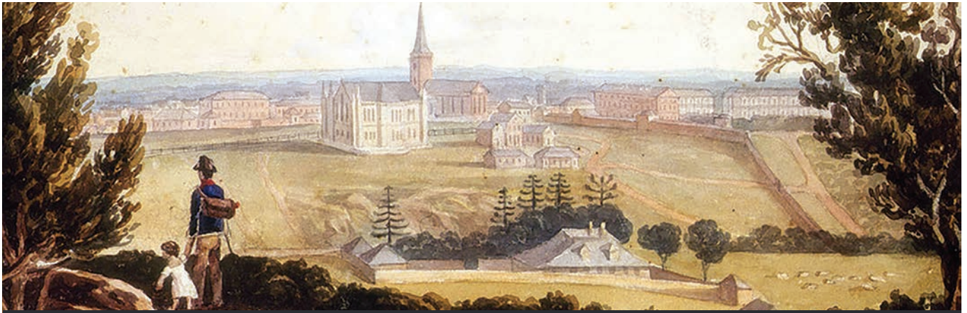
Hyde Park Barracks and the first St Mary's Catholic Church 1835.